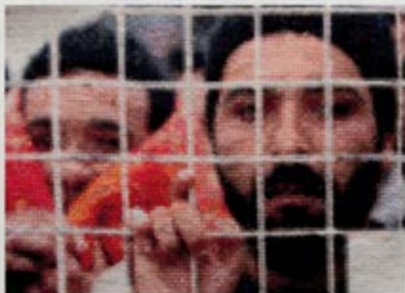
Hanging By A Thread #4

Human beings are in the focus of my work – their interaction with the surrounding and the society, the way they deal with difficult situations. I am not interested in the details of their faces or their bodies. I am rather interested in what they are capable of when they happen to be in special life situations.