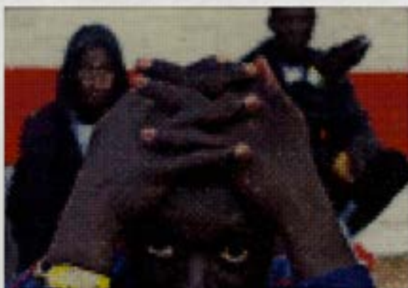
Hanging By A Thread #6

I am interested in their ways of finding solutions and strategies, their will to achieve their goals and their joy in life. I am interested whether these people seek their fortunes alone or in company.