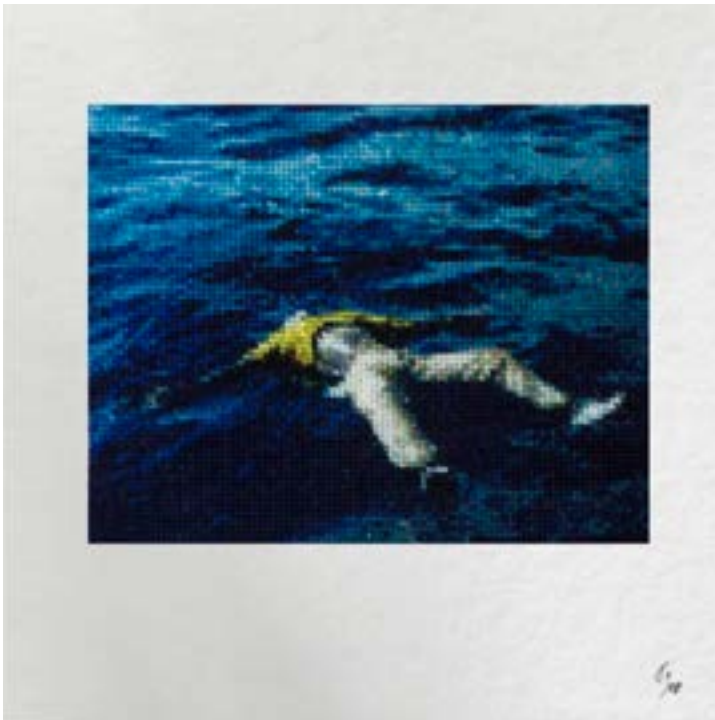
Hangin' By A Thread #12

Handcraft - for thousands of years known as the art of ordinary men and women, is representing to me human creativity and joy of life. Their aspiration is to remain in memory, to create something significant.